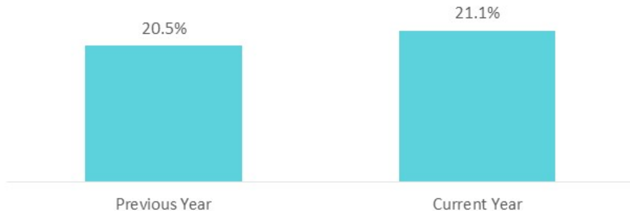
Mango Category Shrink

Note: Current year runs from March 2018 through March 2019