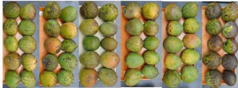
Hot water alone