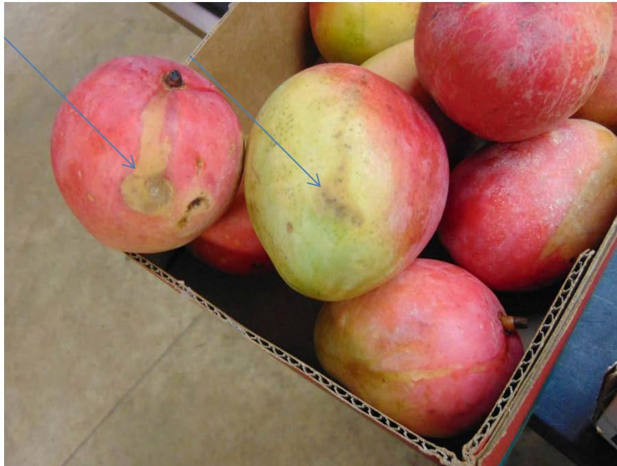
Figure 2: Mangoes used in second large test. Severe anthracnose symptoms were observed prior to the treatments and continued to expand after treatment.

Figure 1. Evidence that surface injury by heated dilute ethanol was related to dried latex deposits on fruit surfaces—note arrows pointing to injuries.