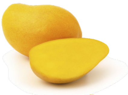
HONEY / ATAULFO

To speed up ripening, place mangos in a paper bag. Once ripe, mangos should be moved to the refrigerator, which will slow down the ripening process. Whole, ripe mangos may be stored for up to five days in the refrigerator. Mangos can be peeled, cubed and placed in an airtight container in the refrigerator for several days, or in the freezer for up to six months.