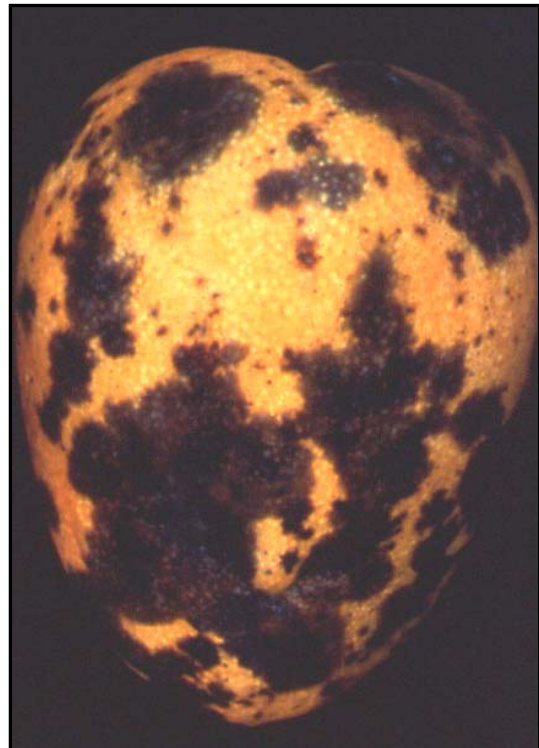
Fig. 4. Alternaria black spot, caused Alternaria alternata .

and Hofman, 2009). Floral induction is usually achieved with applications of \text{KNO}_3 (The growth retardant paclobutrazole is also used for this purpose, but it is not registered in the USA). These treatments are not effective in the subtropics or on all cultivars (e.g. 'Kensington'). And on other cultivars (e.g. 'Kent'), applications of \text{KNO}_3 increase flowering but do not alter its timing. Thus, pre-harvest management of anthracnose often relies only on chemical, and to a lesser extent biological, inputs.