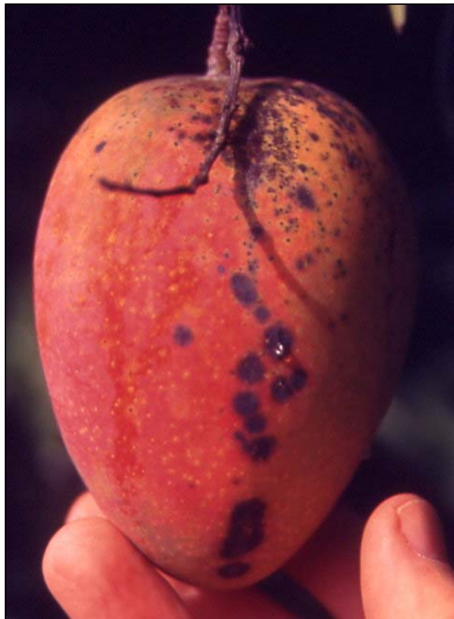
Fig. 2. Anthracnose on 'Edward'

Anthracnose affects leaves, flowers and fruit, and inoculum is present year-round throughout the canopy. Management requires an awareness of this ever-present threat and the weather conditions that promote infection and disease development. Optimum disease control relies on