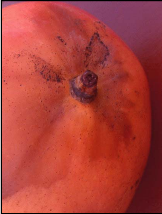
Fig. 3. Stem-end rot, caused by Lasiodiplodia theobromae .

Pre-harvest management of anthracnose relies on: i) orchard sanitation (removing sources of inoculums); ii) altering the time of flowering to ensure that fruit set and development occur during dry conditions (this also focuses on off-season production for profitable market windows); and iii) an integration of these and other chemical and biological measures (Johnson and Hofman, 2009). Despite its potential beneficial impact, sanitation is often not practiced due to its difficulty and expense (Akem, 2006; Prusky et al., 2009). And flower manipulation is not possible in all situations (Johnson